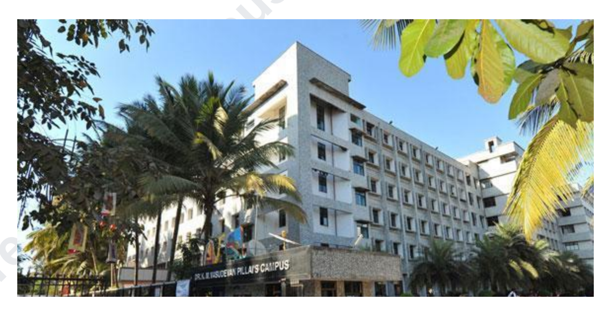
Dr. K. M. Vasudevan Pillai's Campus, Sector - 16, New Panvel - 410 206

To develop professional engineers with respect for the environment and make them responsible citizens in technological development both from an Indian and global perspective. This objective is fulfilled through quality education, practical training and interaction with industries and social organizations.